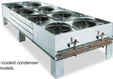
Typical remote air-cooled condenser for use on TTI-A models.