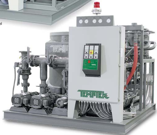
TTI-60W shown. 60 ton water-cooled model with optional standby pump and manifold.

PRICE & PERFORMANCE... for the LONG TERM