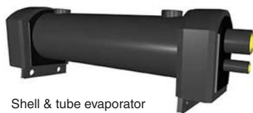
Shell & tube evaporator

Shell & tube evaporators are used on larger capacity systems. Refrigerant is circulated through copper tubes within the carbon steel shell to cool the process fluid that surrounds the tubes. Shell & tube evaporators are fully insulated and provide flexible, efficient heat transfer.