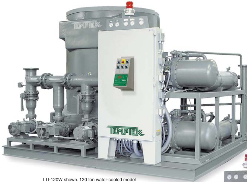
TTI-120W shown. 120 ton water-cooled model with optional standby pump and manifold.

* Customized smaller and larger systems available.